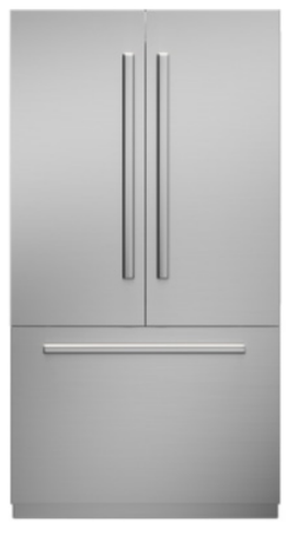
REF36FDBZPNV/24 + SP36FDX/24 + HK36PROFDBXV