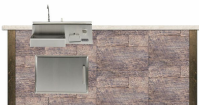
RTAC-B8-R(L/R)-WB* Weathered Wood - Brown Terra