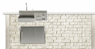
RTAC-B8-R(L/R)-RW* Reclaimed Brick - White