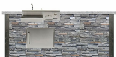
RTAC-B8-R(L/R)-SG* Stacked Stone - Stone Gray