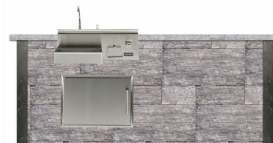
RTAC-B8-R(L/R)-WG* Weathered Wood - Stone Gray

*Must specify L (left) or R (right) configuration.