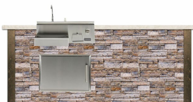
RTAC-B8-R(L/R)-SB* Stacked Stone - Brown Terra