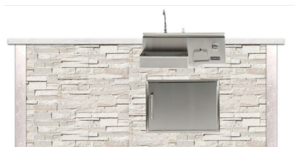
RTAC-B8-R(L/R)-SW* Stacked Stone - White