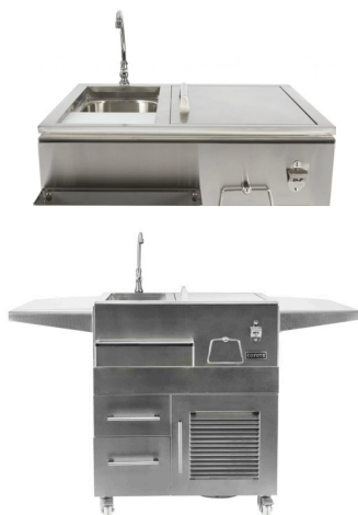
CRC + C2UNCT