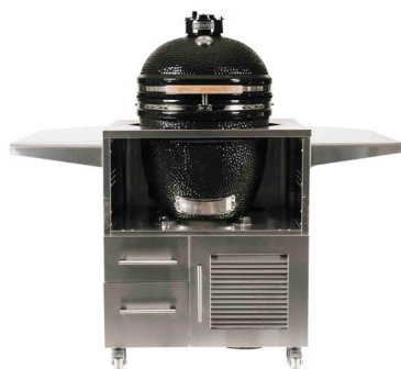
C1CHCS + C2UNCT