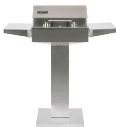
C1EL120SM + C1ELCT21