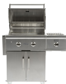
C1C28-FS + C1CSB