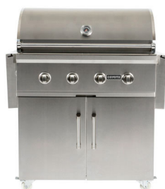
C2C36 + C1S36CT