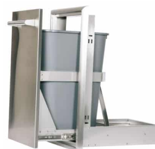
CSTC - inside view