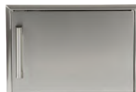
CSA1420 14"X20" SINGLE DOOR