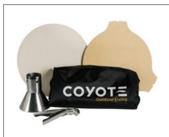
ASADO-ACC ACCESSORY BUNDLE

When the Asado has cooled and is not in use, cover it with an Asado rain cover for extra protection.