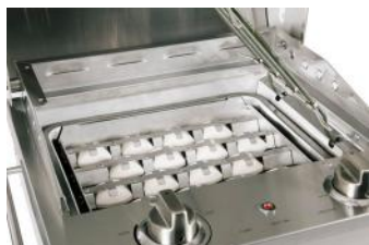
BRIQUETTE TRAY WITH ELEMENT