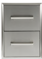
CPOD PULLOUT DRAWER Holds standard propane tank