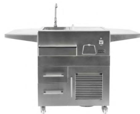
C2UNCT with REFRESHMENT CENTER