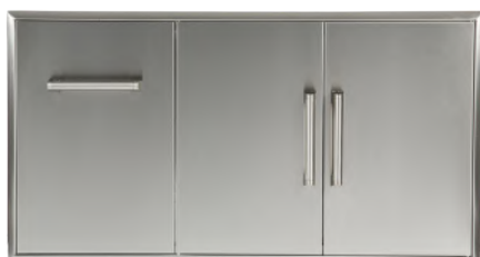
CCD-POD 45" COMBO DOORS/DRAWER

All cabinets are made of rigid, premium stainless steel with a consistent beveled trim and professional handles. All drawers use easy open rollers.