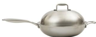
CWOK - WOK