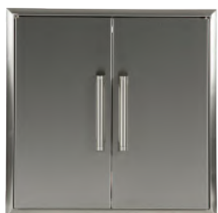
CDA2426 24"X26" DOUBLE DOOR