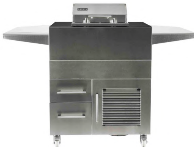
ELECTRIC GRILL ISLAND