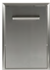
CPOD PULLOUT DRAWER Holds standard propane tank