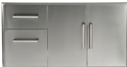
CCD-2DC 45" COMBO DOORS/DRAWERS