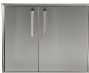
CDPC31 31" DRY PANTRY WITH DRAWERS