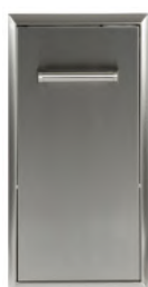
CSTC 14" SINGLE PULL OUT TRASH & RECYCLE