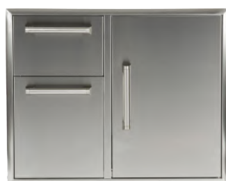
CCD-2DC31 31" COMBO DOOR/DRAWERS