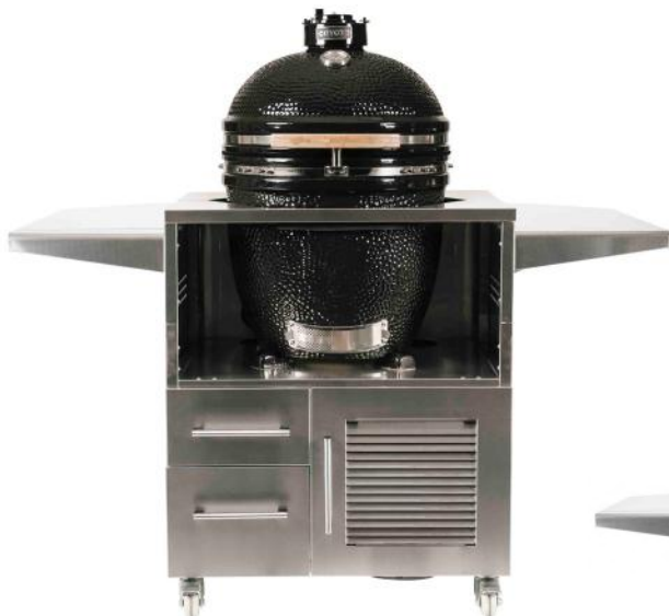
C2UNCT with ASADO