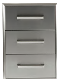
C3DC 17" W THREE-DRAWER CABINET