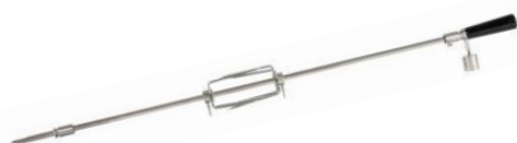
CROT - ROTISSERIE KIT