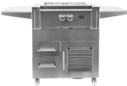
C2UNCT with POWER BURNER