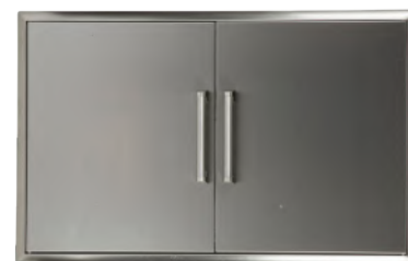
CDA2439 24" X 39" DOUBLE DOOR