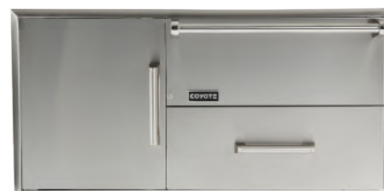
CCD-WD 42" COMBO WITH WARMING DRAWER - Electric heating element (400 watt) - Temperature range of 90° F - 250° F