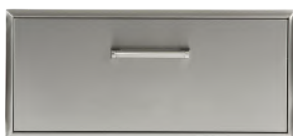
CSSD 30" storage drawer