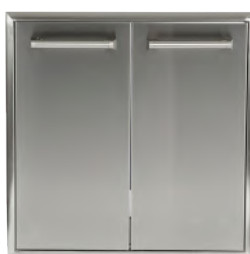
CTC 27" DUAL PULL OUT TRASH & RECYCLE