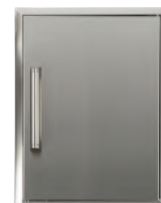
CSA2014 20"X14" SINGLE DOOR