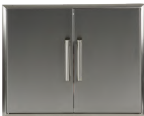
CDA2431 24" X 31" DOUBLE DOOR