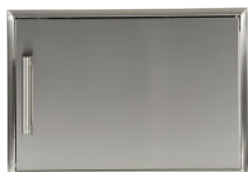
CSA1724 17"X24" SINGLE DOOR

All access doors are made of rigid, premium 304 stainless steel with a consistent beveled trim and professional handles.