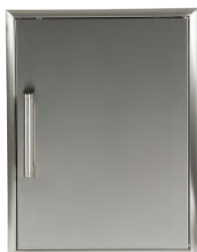
CSA2417 24"X17" SINGLE DOOR